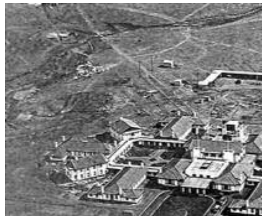
Above is a photograph of the Hotel Canberra around 1926. The walking track that we used is the one going across the creek. The power poles went across to Howie's settlement and then over to our houses. The photograph below shows in the

These photographs brought back many memories of walking across to the Hotel Canberra to catch the bus. I recall walking down the steep hill to cross the plank bridge over the creek and then up the hill to the Hotel Canberra, but had forgotten just how big the creek was until I looked at the photographs. This creek, with the exception of a small section near Scrivener's Plan Room is now confined to pipes that lead the water into Lake Burley Griffin.