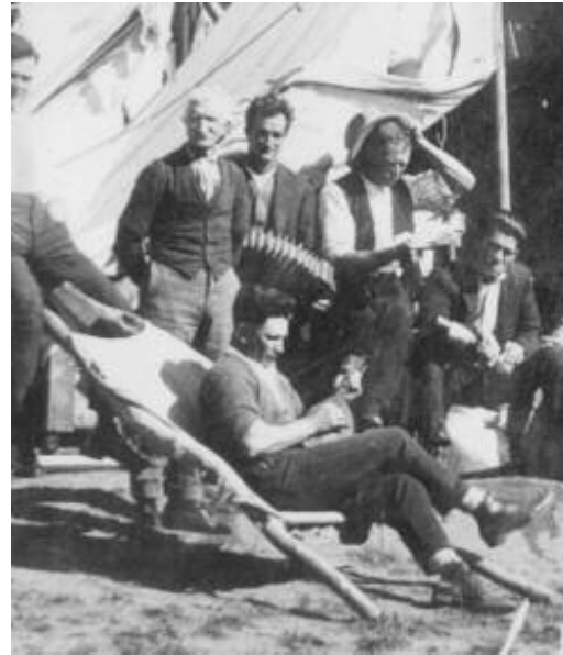
Above detail of a 1924 photograph of men of No 1 Labourers Camp.

Reference to No 1 Camp on Capitol Hill I found in at least one document, however, the majority of documents state – WESTLAKE . This new information suggests that at least one part of Capitol Hill (now Capital Hill) was considered to be Westlake.