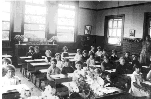
Above: Telopea Park Class circa 1924