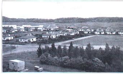
Above: Power House Cottages built 1921/1922. Photograph taken in 1926.