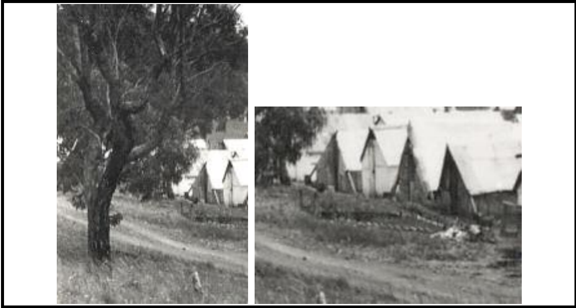
Below are photographs showing the brick edged bed at the Ablution Block site and a photograph taken from the old track looking up the hill towards the embassy.