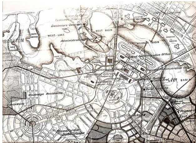
Above: Early 1920s map of Canberra areas. Blandfordia sub-division bottom left is Forrest.