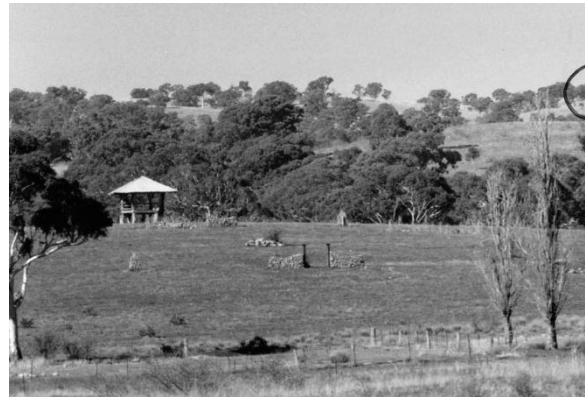
Above left column where the bust of Sir Henry Parkes stood and right, Bandstand 1999. The bust that sat on top of the column was destroyed by people using it for target practice.