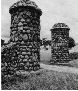
Above left: Entrance gate to Environa Women's Weekly article