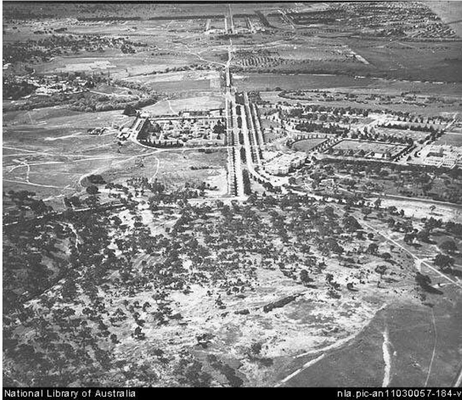
Above: Mildenhall photograph 1930s? showing Ainslie top right hand section.