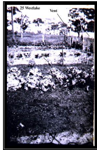
Ngunawal scarred tree on Stirling Ridge; Lady Denman 1913 and Box's garden at rear of 23 Westlake (with sewer vent in background).