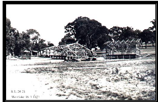
R.L. 28 24 Westlake 16 3 1923

View 1924 of houses 22-27 with some of the finished cottages in background.