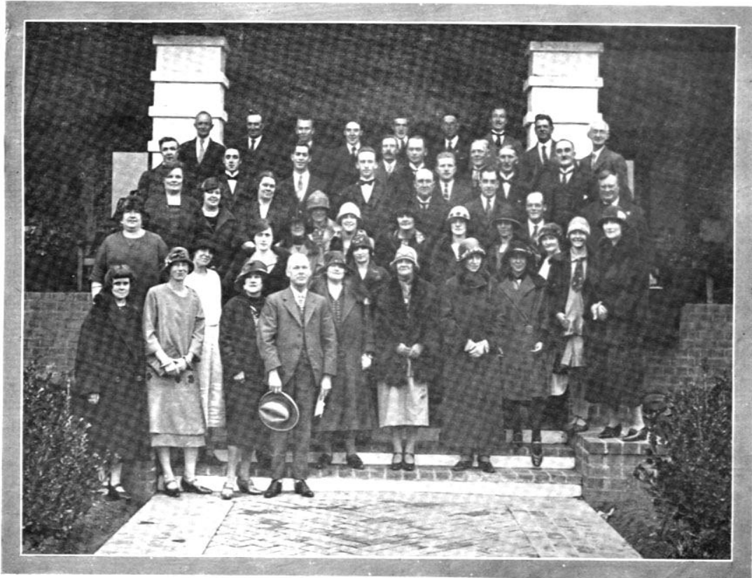
MUSIC AT CANBERRA. THE PHILHARMONIC SOCIETY.

(Registered at the General Post Office, Sydney, for transmission by Post as a Newspaper.)